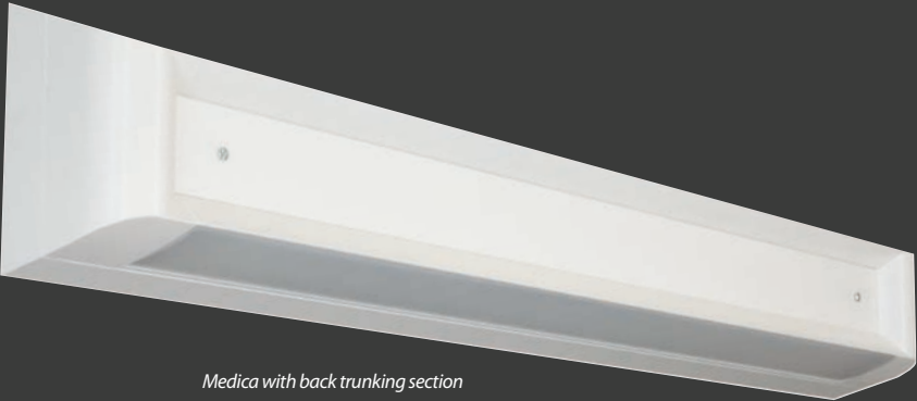
Medica with back trunking section