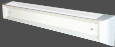
Medica without back trunking section